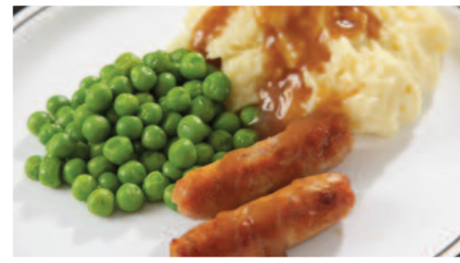
Sausages served with Mashed Potato, Seasonal Vegetables & Gravy