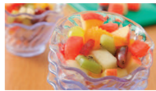
Fresh Fruit Salad