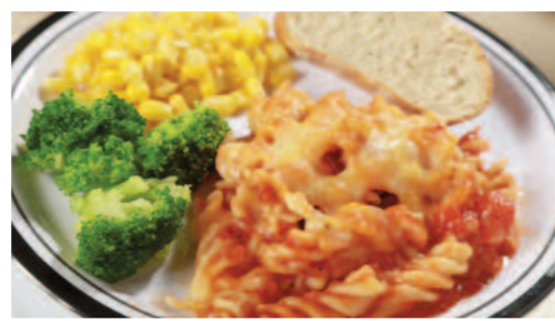
Cheese & Tomato Pasta served with Garlic & Herb Bread and Seasonal Vegetables