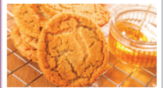
Golden Crunch Cookie

AVAILABLE EVERY DAY – UNLIMITED SALAD, FRESHLY BAKED BREAD, FRUIT YOGHURT & FRESH FRUIT PLATTER. FOR ALLERGEN INFORMATION, PLEASE ASK ONE OF OUR CATERING TEAM. ALL THE ABOVE DISHES ARE SUBJECT TO AVAILABILITY.