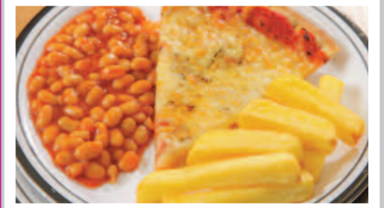
Cheese & Tomato Pizza served with Chips & Peas or Baked Beans

VEGETARIAN VERSIONS OF THE ABOVE MEAL AVAILABLE DAILY