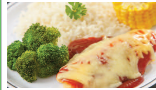
BBQ Chicken served with Savoury Rice and Seasonal Vegetables