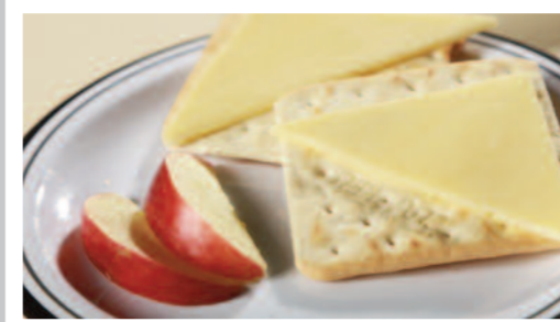
Cheese & Crackers