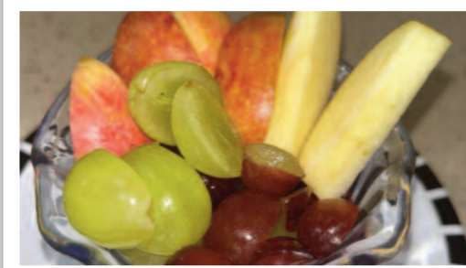
Apple & Grape Pot