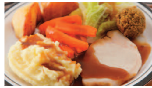
Roast Pork served with Roast/Mashed Potatoes, Seasonal Vegetables & Gravy