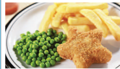
Fish Star (MSC) served with Chips & Peas or Baked Beans

VEGETARIAN VERSIONS OF THE ABOVE MEAL AVAILABLE DAILY