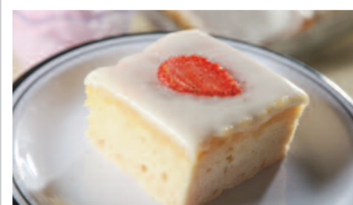
Strawberry Ice Cream Cake