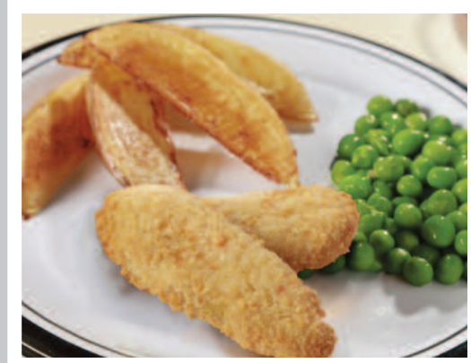
Breaded Chicken Goujons served with Potato Wedges & Seasonal Vegetables