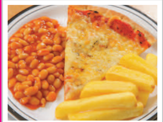
Cheese & Tomato Pizza served with Chips & Peas or Baked Beans