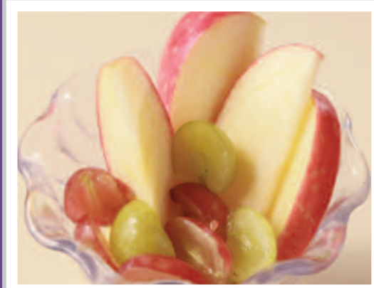
Apple & Grape Pot