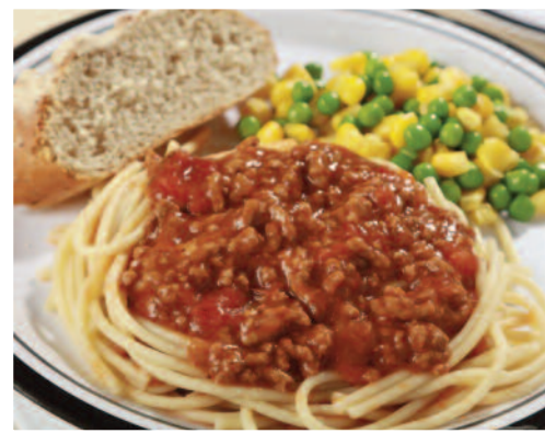
Spaghetti Bolognese served with Garlic & Herb Bread and Seasonal Vegetables