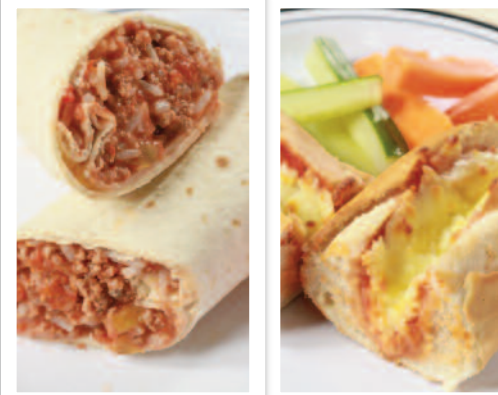
Cowboy Beef & Rice Burrito served with seasonal Vegetables or Carrot & Cucumber Sticks or Hot Pizza Baguette served with Carrot & Cucumber Sticks