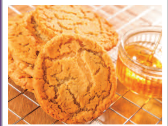
Golden Crunch Cookie

AVAILABLE DAILY – UNLIMITED SALAD, FRESHLY BAKED BREAD, FRUIT YOGHURT, FRESH FRUIT PLATTER & CHILLED WATER. FOR ALLERGEN INFORMATION, PLEASE ASK ONE OF OUR CATERING TEAM. ALL THE ABOVE DISHES ARE SUBJECT TO AVAILABILITY.