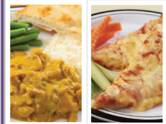
Chinese Chicken Curry served with Rice, Naan Bread & Seasonal Vegetables or Deep Pan Cheese & Tomato Pizza Slices served with Carrot & Cucumber Sticks