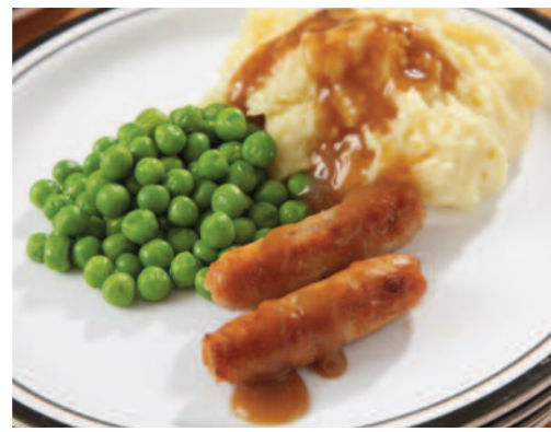
Sausages served with Mashed Potato, Seasonal Vegetables & Gravy