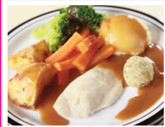
Roast Chicken served with Roast/Mashed Potatoes, Seasonal Vegetables & Gravy