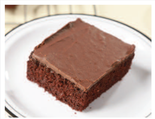
Wacky Chocolate Cake