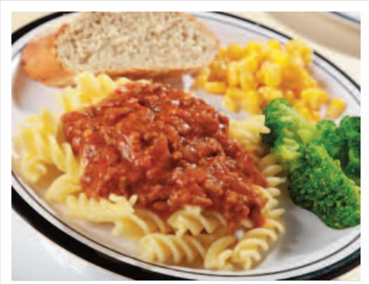
Pasta Bolognese served with Garlic & Herb Bread and Seasonal Vegetables