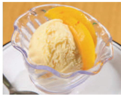
Ice Cream & Fruit