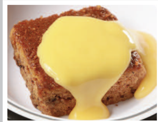
Sticky Toffee Pudding served with Custard