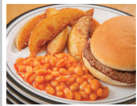
Beef Burger served in a Bun with Potato Wedges & Seasonal Vegetables or Baked Beans