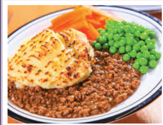
Cottage Pie served with Seasonal Vegetables