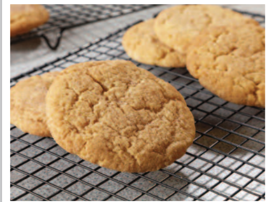
Snicker Doodle Biscuit

AVAILABLE DAILY – UNLIMITED SALAD, FRESHLY BAKED BREAD, FRUIT YOGHURT, FRESH FRUIT PLATTER & CHILLED WATER. FOR ALLERGEN INFORMATION, PLEASE ASK ONE OF OUR CATERING TEAM. ALL THE ABOVE DISHES ARE SUBJECT TO AVAILABILITY.