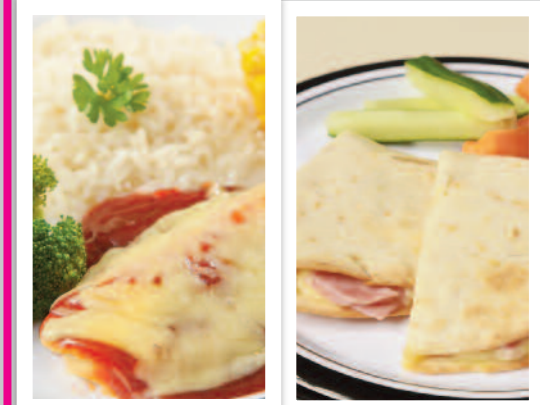
BBQ Chicken served with Savoury Rice and Seasonal Vegetables or Hot Cheese & Ham Wrap served with Carrot & Cucumber Sticks