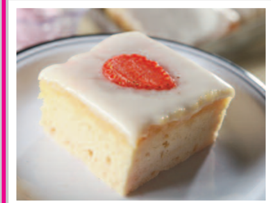
Strawberry Ice Cream Cake