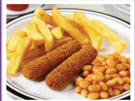
Breaded Mozzarella Sticks served with Chips & Peas or Baked Beans