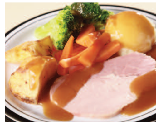
Honey Roast Gammon served with Roast/Mashed Potatoes, Seasonal Vegetables & Gravy