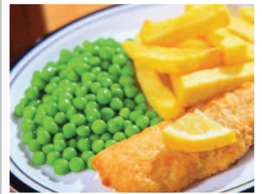
Battered Fish (MSC) served with Chips & Peas or Baked Beans