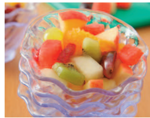
Fresh Fruit Salad