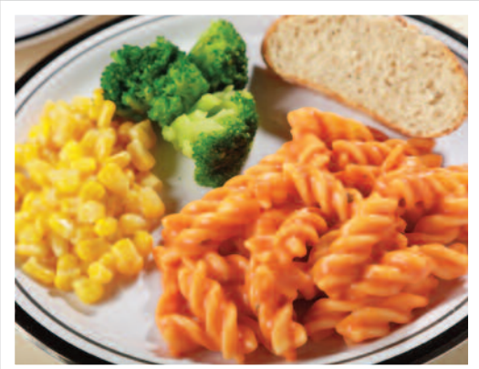
Tomato & Mascarpone Cheese Pasta served with Garlic & Herb Bread and Seasonal Vegetables